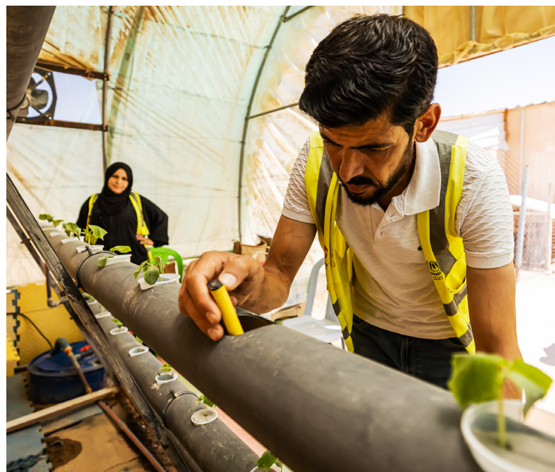
Refugees in dry, dusty Azraq Camp work on an innovative CARE project growing vegetables in greenhouses.

Women are far less likely to be engaged in the paid workforce than men; Jordan's female labor force participation rate is one of the lowest in the world. Most (62%) female respondents gave their main occupation as "housewife."