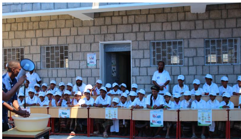
Hygiene promotion activity for students on The Global Handwashing Day / Lahj gov. Tor Albaha

18.9 Million people in Yemen require humanitarian assistance with 14.5 million lacking access to safe water and sanitation services. More than half of all health facilities in Yemen are closed or partially functioning as a result of the conflict.