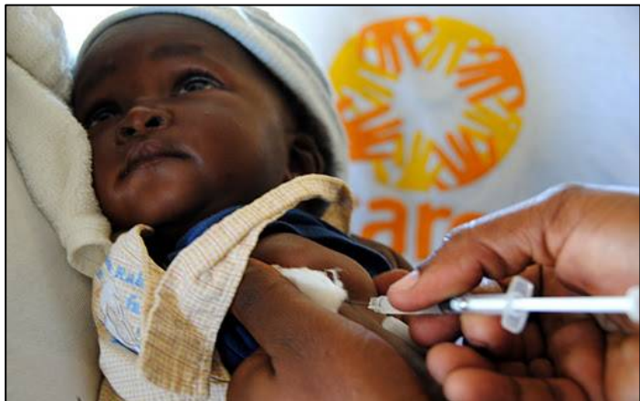
A baby is vaccinated at one of CARE's reproductive health centers in Léogâne. CARE has established a partnership with HELP Hospital, which send nurses twice a week, to vaccinate children and pregnant women, provide