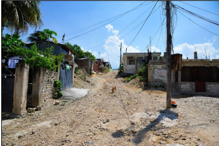
Poor infrastructure, including the lack of proper sidewalks and retaining walls, is an impediment to the return of displaced people to permanent neighborhoods.

To help foster the return of displaced people to established communities, in late 2011 CARE began surveying the quality of infrastructure in the densely settled Carrefour neighborhood in Port-au-Prince. We aim to create a better living environment by: empowering community-based organizations; legitimizing informal neighborhoods by reinforcing links with public institutions; developing an urban plan for the community; and improving basic living conditions in the entire neighborhood.