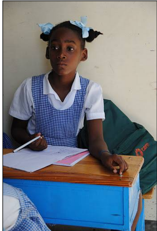
CARE has helped schools recover from the earthquake by providing learning materials and training sessions on teaching, school management and psychosocial support.

CARE takes an integrated approach to improving access to and quality of reproductive health services, with a particular focus on the heavily earthquake-affected areas of Léogâne and Carrefour. The project