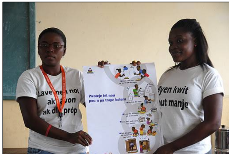
CARE's hygiene promotion team promotes good hygiene behaviors via door-to-door, school and community awareness campaigns.

The ongoing threat of cholera highlights the importance of safe water, sanitation and hygiene (WASH) programs. CARE began WASH interventions after the earthquake to support displaced persons, especially those living in spontaneous camps. As residents gradually continue to leave the camps to move into transitional shelters, permanent homes or with host families, the need for services inside the camps has decreased. Consequently, at 51 sites receiving WASH support from CARE at the beginning of 2011, only minimum facilities are remaining in place to address cholera response needs.