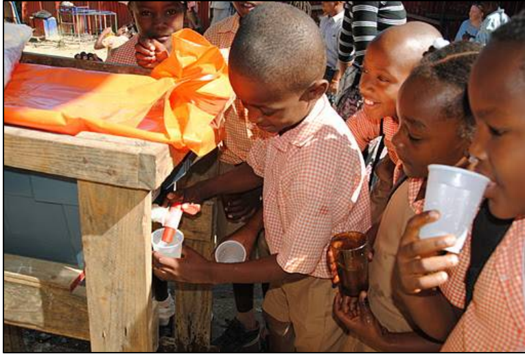
Students at the ASPAM school in Léogâne have access to safe water and sanitation, part of CARE's comprehensive support to the school.

Léogâne was one of the areas hardest hit by Haiti's devastating January 12, 2010 earthquake. Officials estimate the tremor destroyed 80 to 90 percent of Léogâne's buildings. Among the destroyed buildings there were ASPAM's elementary and pre-schools – along with the homes of most the school's children.